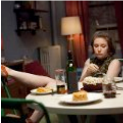
That Sex Scene on Last Night’s “Girls” BY EMILY NUSSBAUM