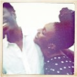
Across the Continent with Everyday Africa BY MARIA LOKKE