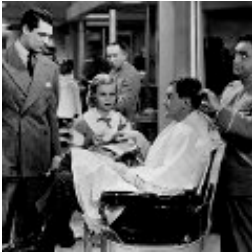
Raoul Walsh and “Big Brown Eyes” BY RICHARD BRODY