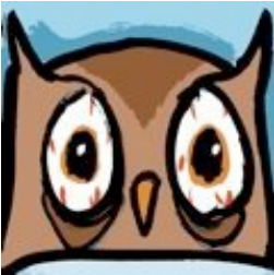
Up All Night: The science of sleeplessness. BY ELIZABETH KOLBERT